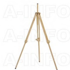
3033QM Wooden Tripod Metalfree