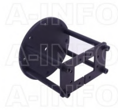
LB-2678-10-C-MB Round Type Mounting Bracket