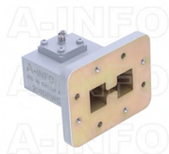
250DRWCAS Right Angle Double Ridge Waveguide to Coaxial Adapter 2.6-7.8GHz WRD250 to SMA Female