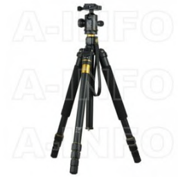
Tripod_15Kg Al Alloy Tripod