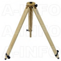
3033HL Wooden Tripod