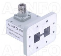
250DRWCAN Right Angle Double Ridge Waveguide to Coaxial Adapter 2.6-7.8GHz WRD250 to N Type Female