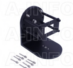
LB-2678-10-C-MBL L type mounting bracket