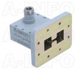
250DRWHCAN Right Angle High Power Double Ridge Waveguide to Coaxial Adapter 2.6-7.8GHz WRD250 to N Type Female