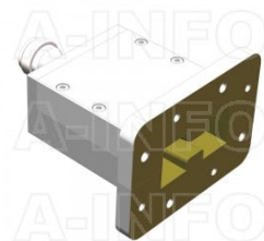
250DRWECAN Endlaunch Double Ridge Waveguide to Coaxial Adapter 2.6-7.8GHz WRD250 to N Type Female