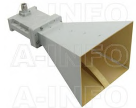
LB-1536-10-C-SF Multi Octave Horn Antenna 1.5-3.6GHz 10dB Gain SMA Female