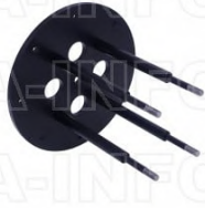
LB-1536-10-C-MB Round Type Mounting Bracket