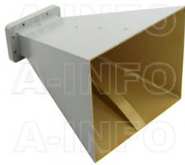
LB-1536-10-A Multi Octave Horn Antenna 1.5-3.6GHz 10dB Gain Double Ridge Waveguide Interface