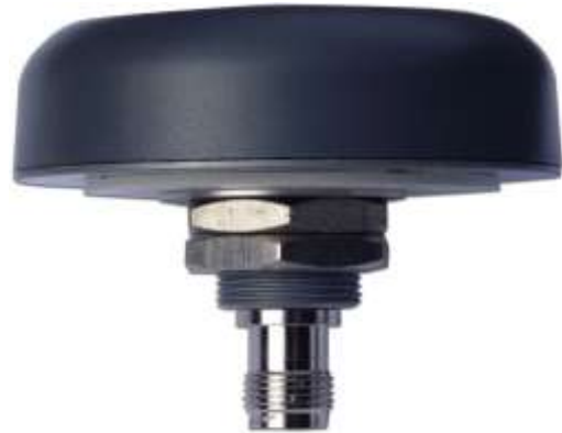
TW3400 Dimensions (mm)

Flat radome is shown, Conical Radome also available